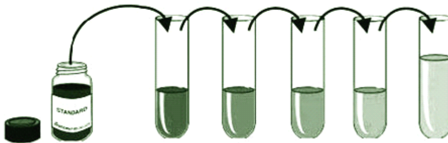
6400ng/L 3200ng/L 1600ng/L 800ng/L 400ng/L 200ng/L

2.The number of stripes needed is determined by that of samples to be tested added by that of standards. It is suggested that each standard solution and each blank well should be arranged with three or more wells as much as possible.